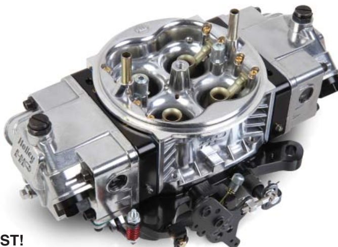
Shiny Aluminum Ultra HP - with Black Billet