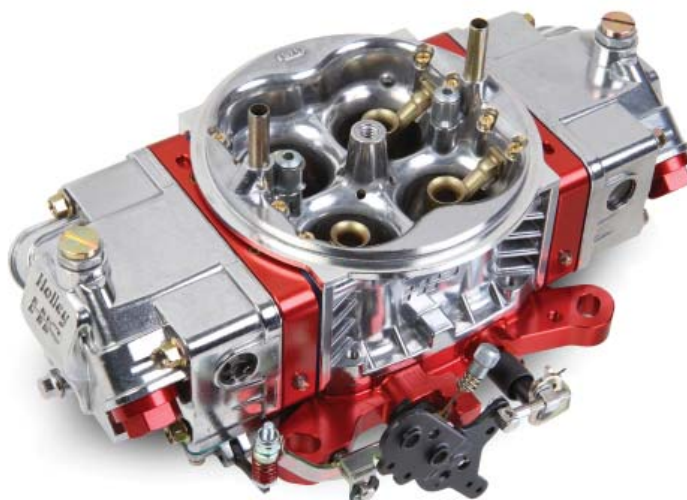
Shiny Aluminum Ultra HP - with Red Billet